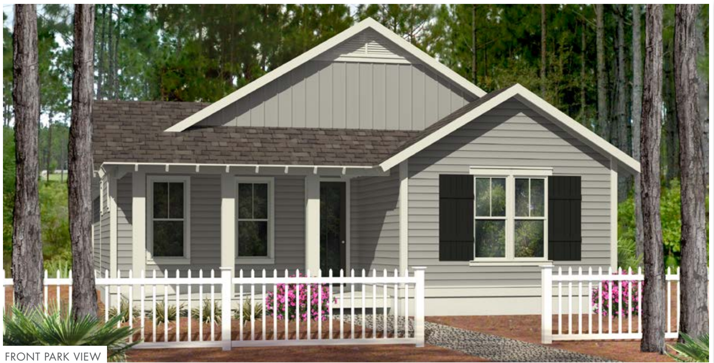
FRONT PARK VIEW