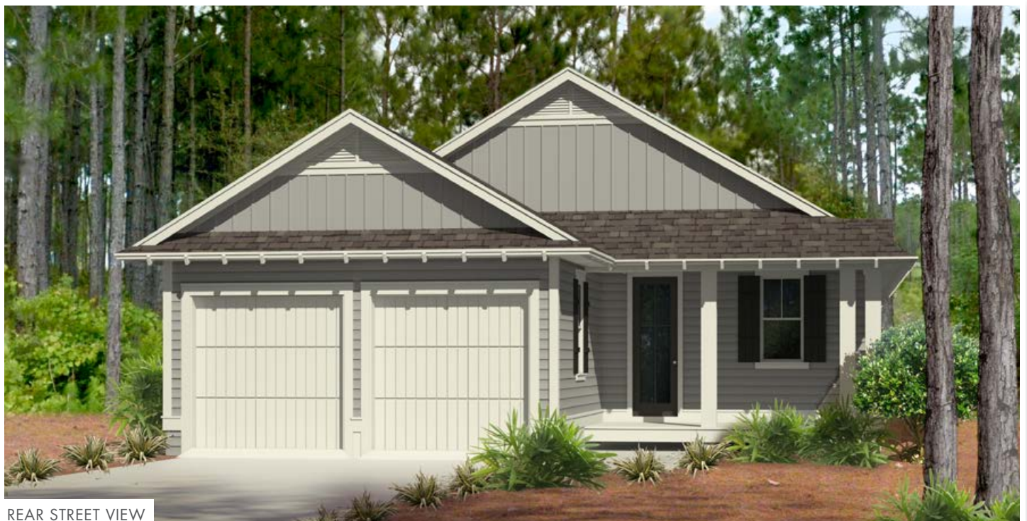
REAR STREET VIEW