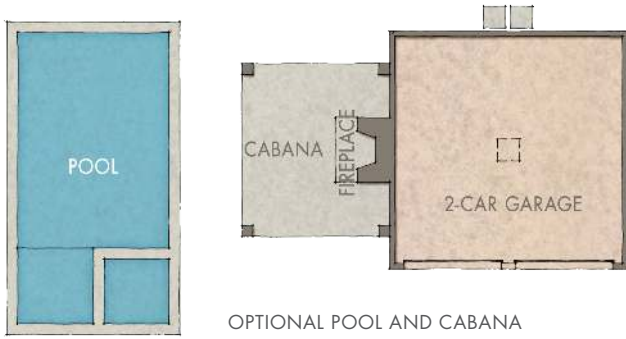
OPTIONAL POOL AND CABANA